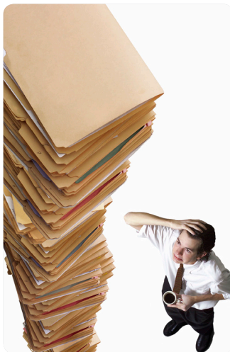
Search Packager: the permanent pain killer for the "I can't find the file" headache.